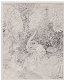
Casey Jex Smith Bronze Balls , 2022 Pen on paper 10 x 8 inches $1,000