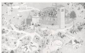
Casey Jex Smith 2013, 2013 Pen on paper 38 x 58 inches $16,000