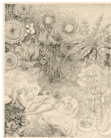
Casey Jex Smith Water Elemental , 2021 Pen on paper 10 x 8 inches $1,000